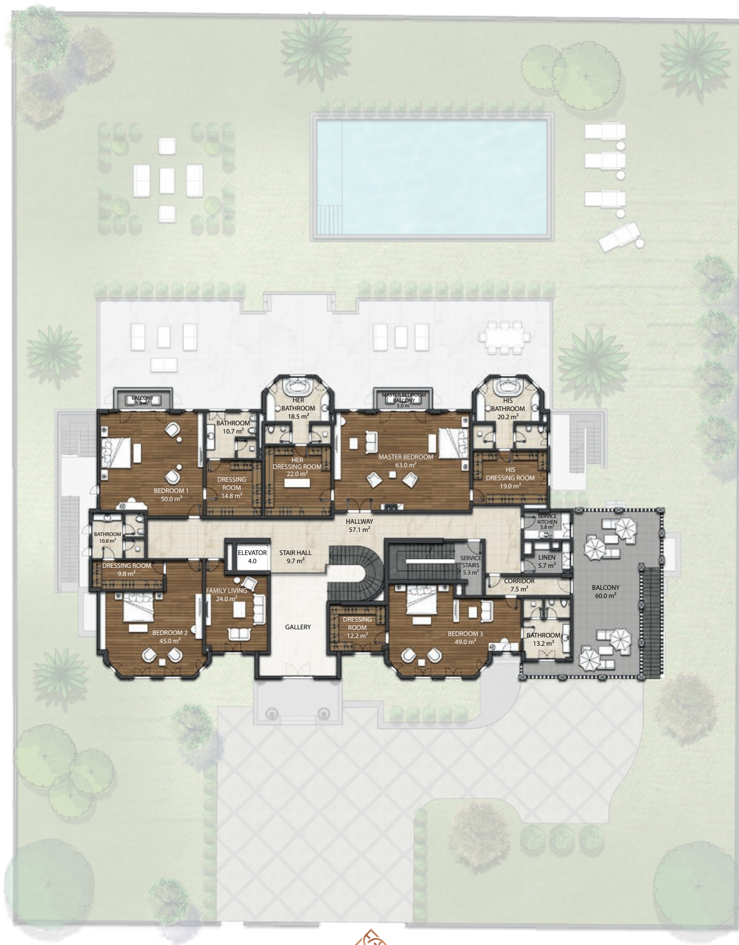
FIRST FLOOR Floor Area : 621,0 m 2