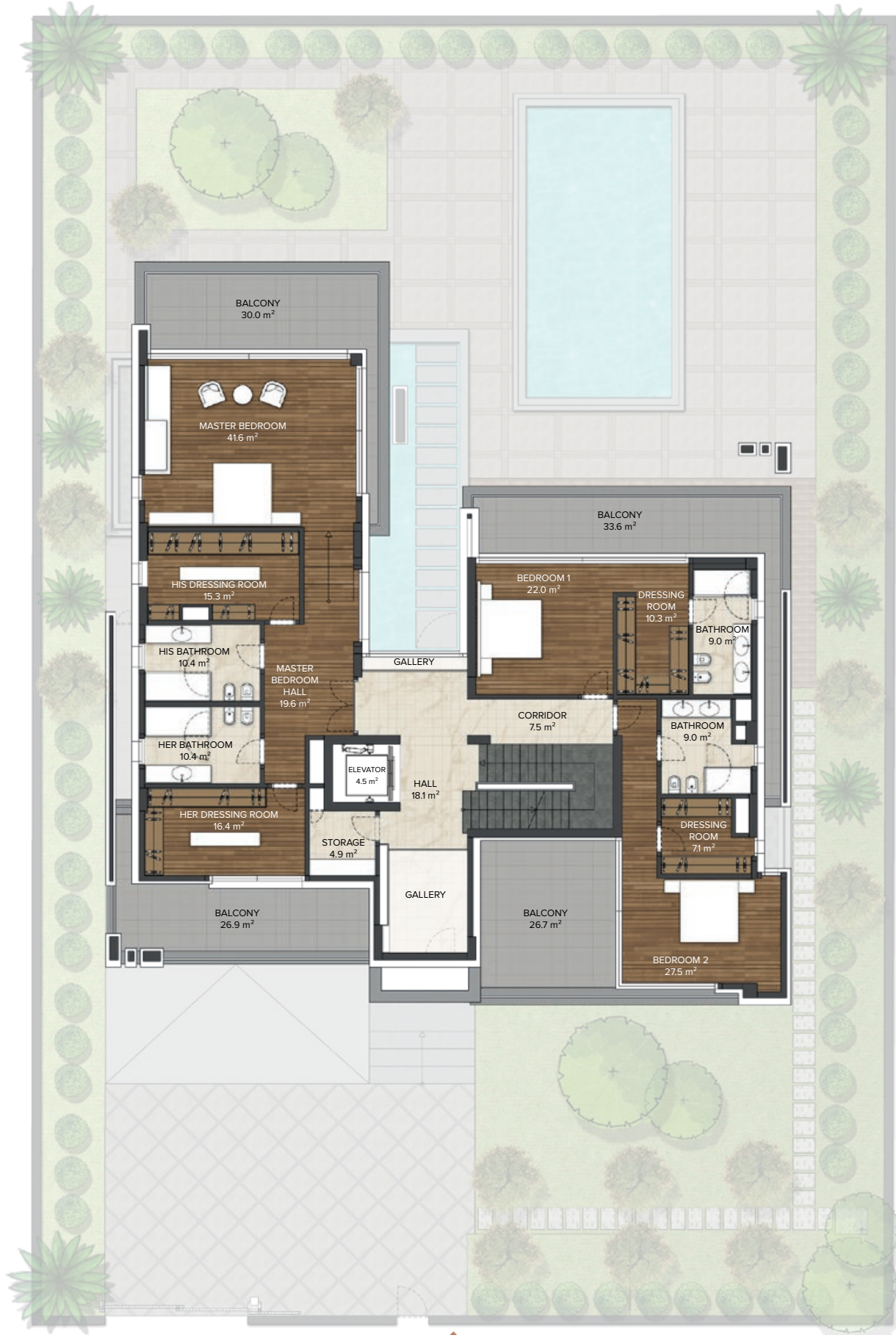
FIRST FLOOR Floor Area : 369,0 m 2